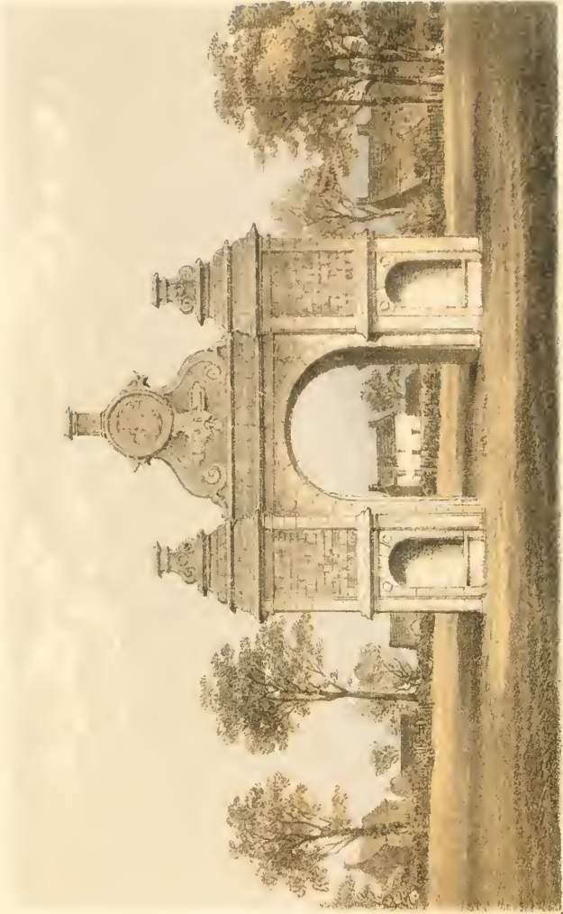
ONE OF THE GATEWAYS AT FOLKELY, 1870